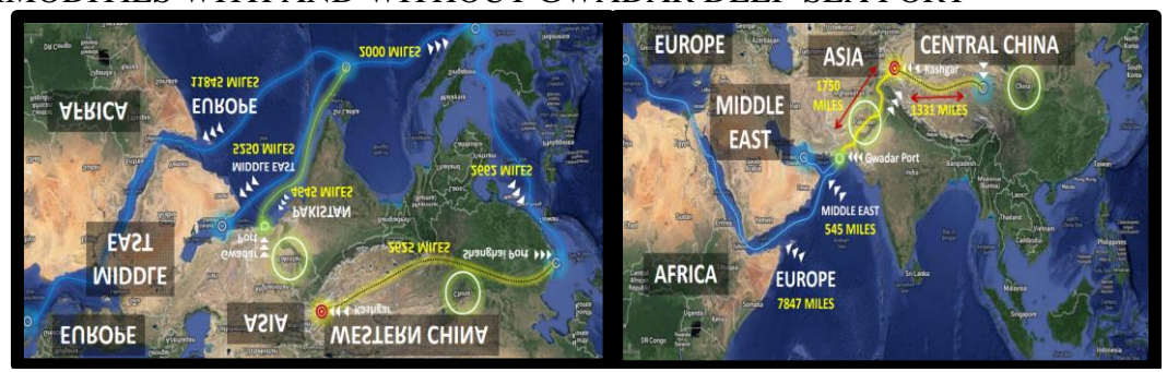
FIGURE 1 – COMPARISON OF SHIPPING ROUTE LENGTH FOR CHINESE COMMODITIES WITH AND WITHOUT GWADAR DEEP-SEA PORT

Siddiqui, A. (2017). Understanding Economic Benefits of Trade-Corridor between Gwadar-Kashgar INTERMODAL Networks. All Pakistan Shipping Association , 1-22.