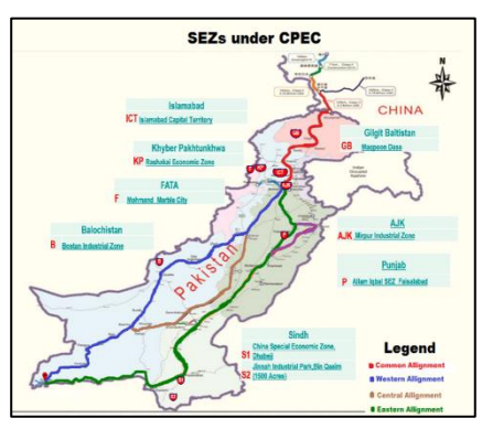
Figure 1: SEZs in Pakistan

alongside the CPEC motorways aiding in delivering the final products from this platform. These various zones as proposed in conjunction between the Pakistani and Chinese federal governments are located in Nowshera (KPK), Dhabeji (Sindh), Bostan (Balochistan), Faisalabad (Punjab) Islamabad (Federal), Port Qasim near Karachi (Federal), Mirpur (AJK), Mohmand (FATA) and Monqbondass (Gilgit/Baltistan). The exact locations and industrial cluster niches can be seen in figure 1